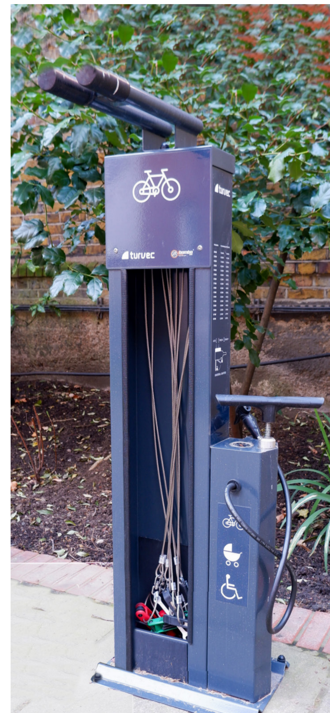
Public bike workstand by Turvec