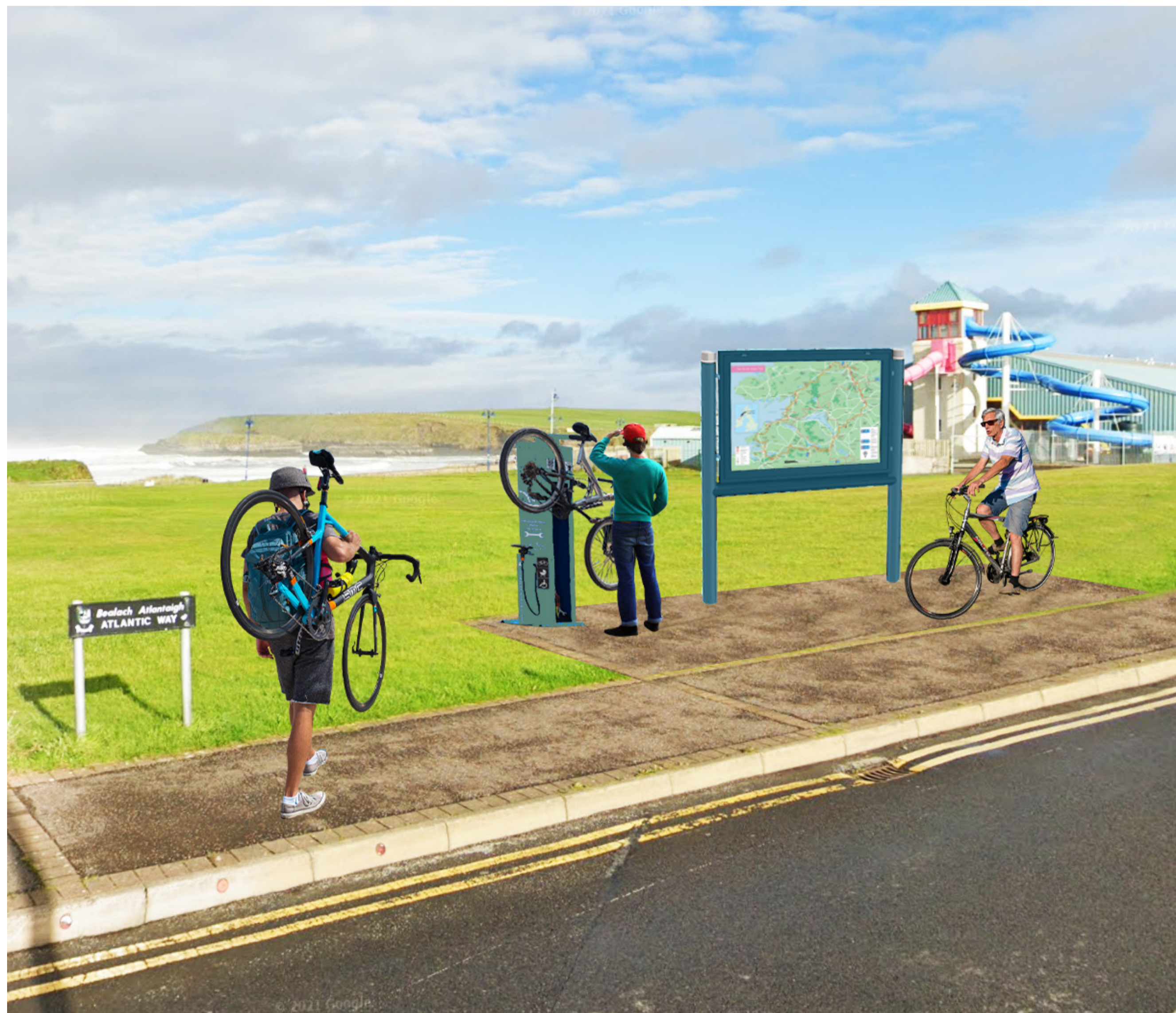
Photomontage of a concept for a bike repair hub at the Pleasure Ground